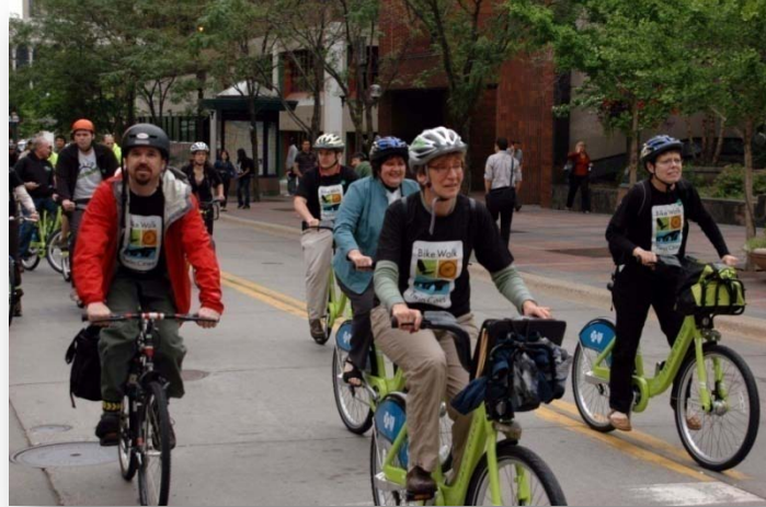
Bike Walk Twin Cities staff and TLC board members at Nice Ride MN Launch