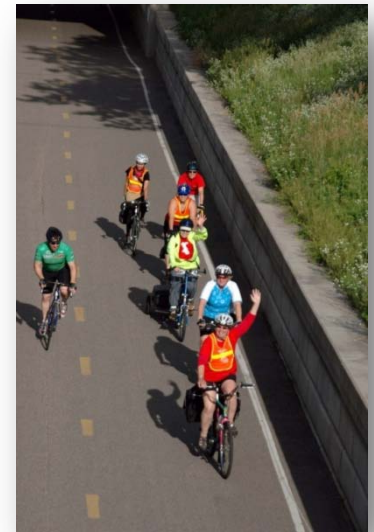
Women bicyclists participate in PM Women's Wednesday ride on Midtown Greenway