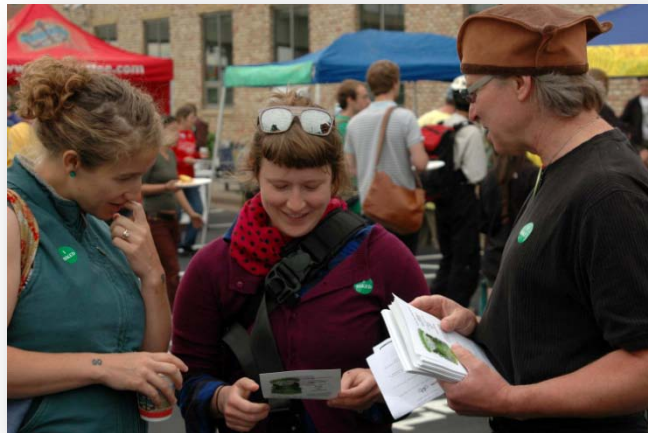
Folks at the Green Institute Celebration Location for Breakfast