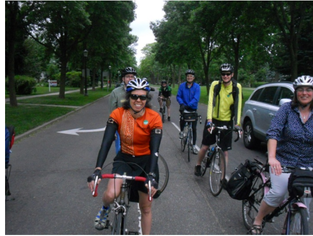
Silver Award ride past Governor's Mansion