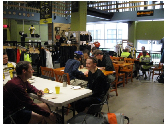
Folks enjoying free breakfast at Freewheel Bike Shop's Midtown Greenway location